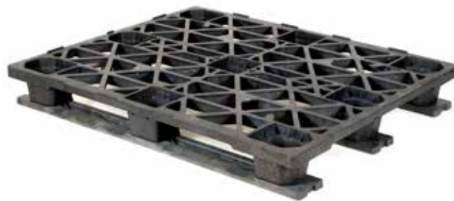
Double stacking options available