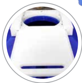
Slide gate, made from high density polyethylene