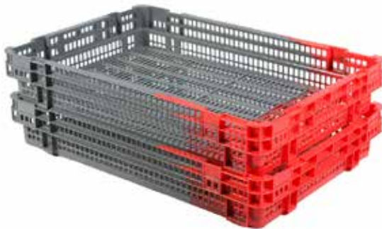
Date Crate - Stacked 3.46" effective height when stacked for harvesting