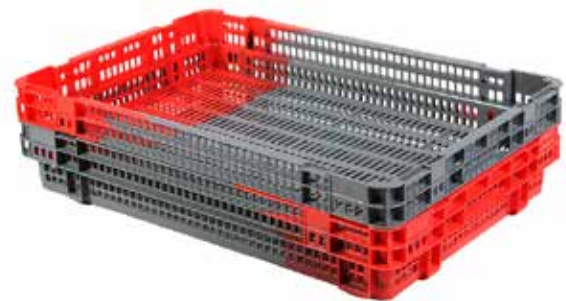
Date Crate - Nested 1.73" effective height when nested for dehydration/drying process