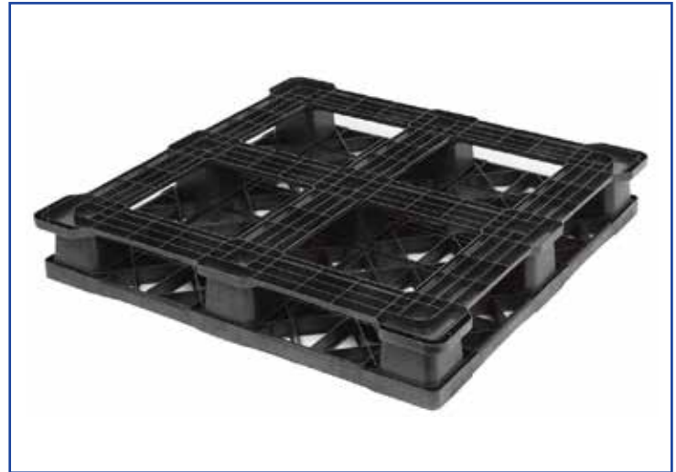
Base attachment option available for double stacking applications