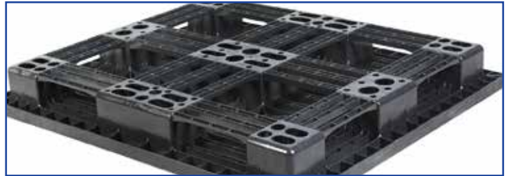
Six wide runners have a stabilizing effect with block-stacking. Runners ensure smooth transport via roller and chain conveyors.