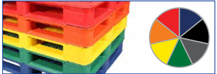
Standard pallet colors.