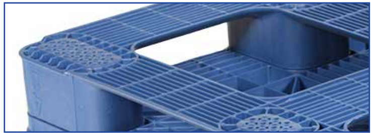
Flow through drainage design.