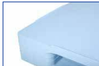
1/4" perimeter lip to better secure pallet loads.