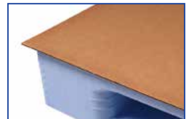
Smooth top deck, no lip option, ideal for slip sheet application.