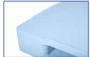
1/4" perimeter lip to better secure pallet loads.