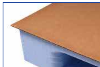
Smooth top deck, no lip option, ideal for slip sheet application.