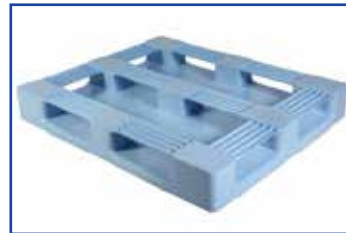
Top and bottom deck are completely closed for maximum hygiene.