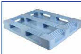
Top and bottom deck are completely closed for maximum hygiene.