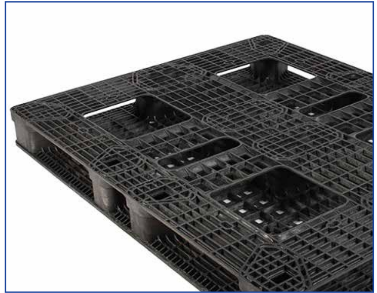
Two-piece design for heavy duty applications.