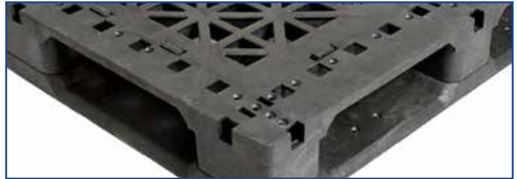
Top deck grommets to better secure pallet loads.