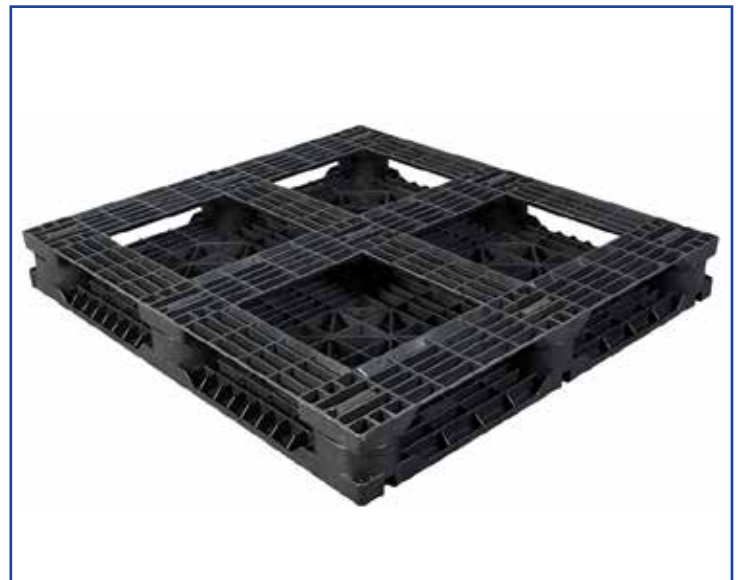
6 runner bottom. Injection molded design.