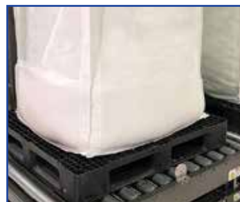
Ideal for bulk bag and drum shipping. Rigid design, great for conveying and for racking applications.