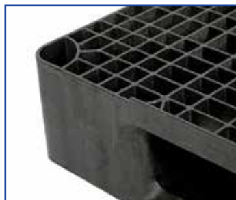
Single-piece design won't cause any separation during transit.