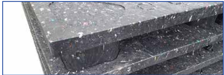
Surface indentations allows for secure stacking.