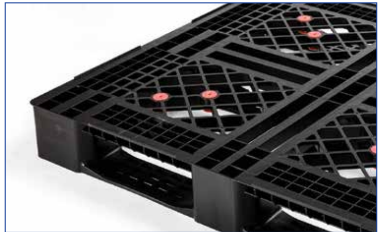
Meets GMA standards with full 6 runner bottom deck design.