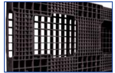
Conveyor system friendly runners.