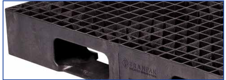
Durable design for better handling while in transit.