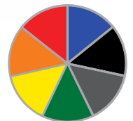
Standard Pallet Colors