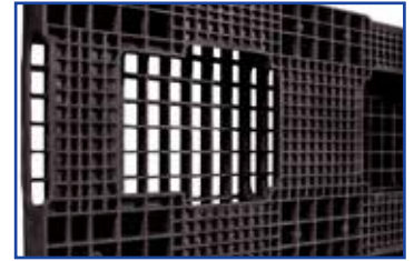
Conveyor system friendly runners.