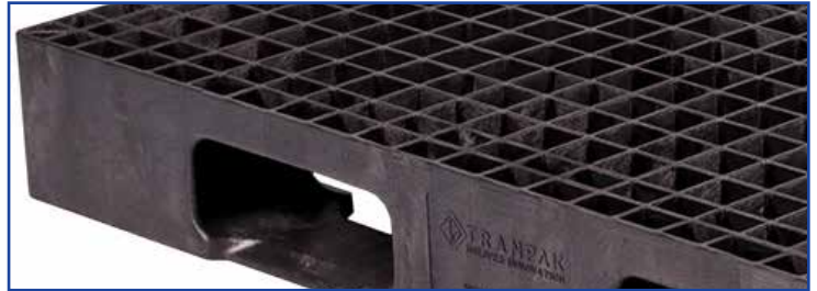
Durable design for better handling while in transit.