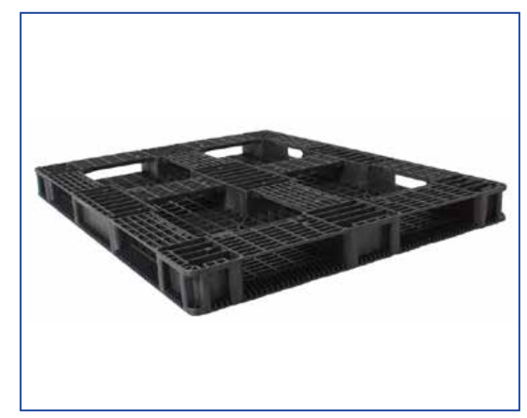
6 runner bottom. Ideal size for beverage industry.

(2)# In A Stack: LTL (Less Than Truckload) = is based upon 96" height of standard LTL carriers. FTL (Full Truckload) = is based upon height of standard 53' trailers.