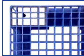
One-piece, flow-through design, prevents any trapped water/contaminants when cleaning.

All specifications are subject to a +/- 3% tolerance.