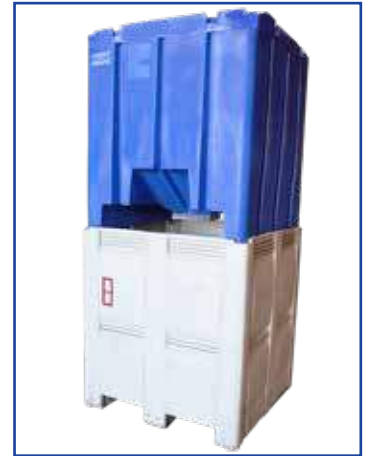
Designed to stack with easy forklift accessibility. Easily stacks on Macro 48 series bins.