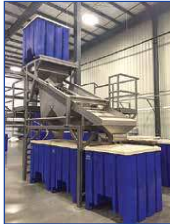
Ideal plastic hopper bin for food processing lines.