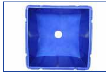
Smooth, food friendly, single-piece, double-wall design.