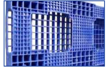
Conveyor system friendly runners.