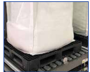
Ideal for bulk bag and drum shipping. Rigid design, great for conveying and for racking applications.