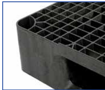
Single-piece design won't cause any separation during transit.