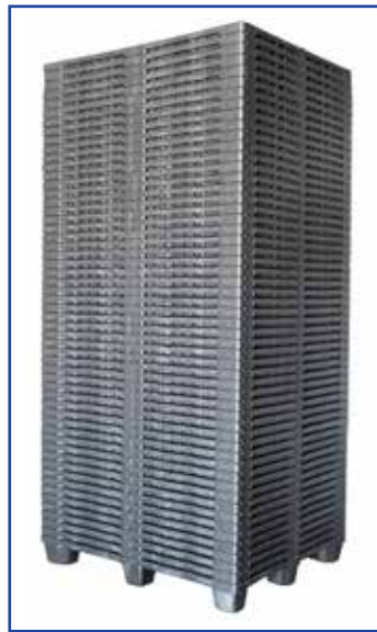
Maximize shipments with nestable design