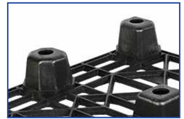
Open design promotes drainage.