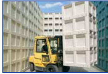
Unique interlocking foot design for easy stacking.

(1) FTL = Full Truckload - based on 53' standard trailer.