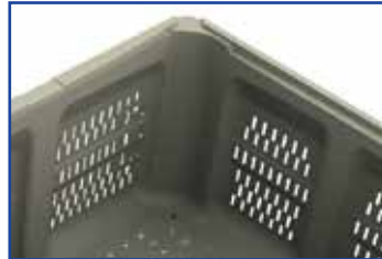
Increased ventilation slots promote better air flow to cool down product faster.