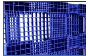
Conveyor system friendly runners.